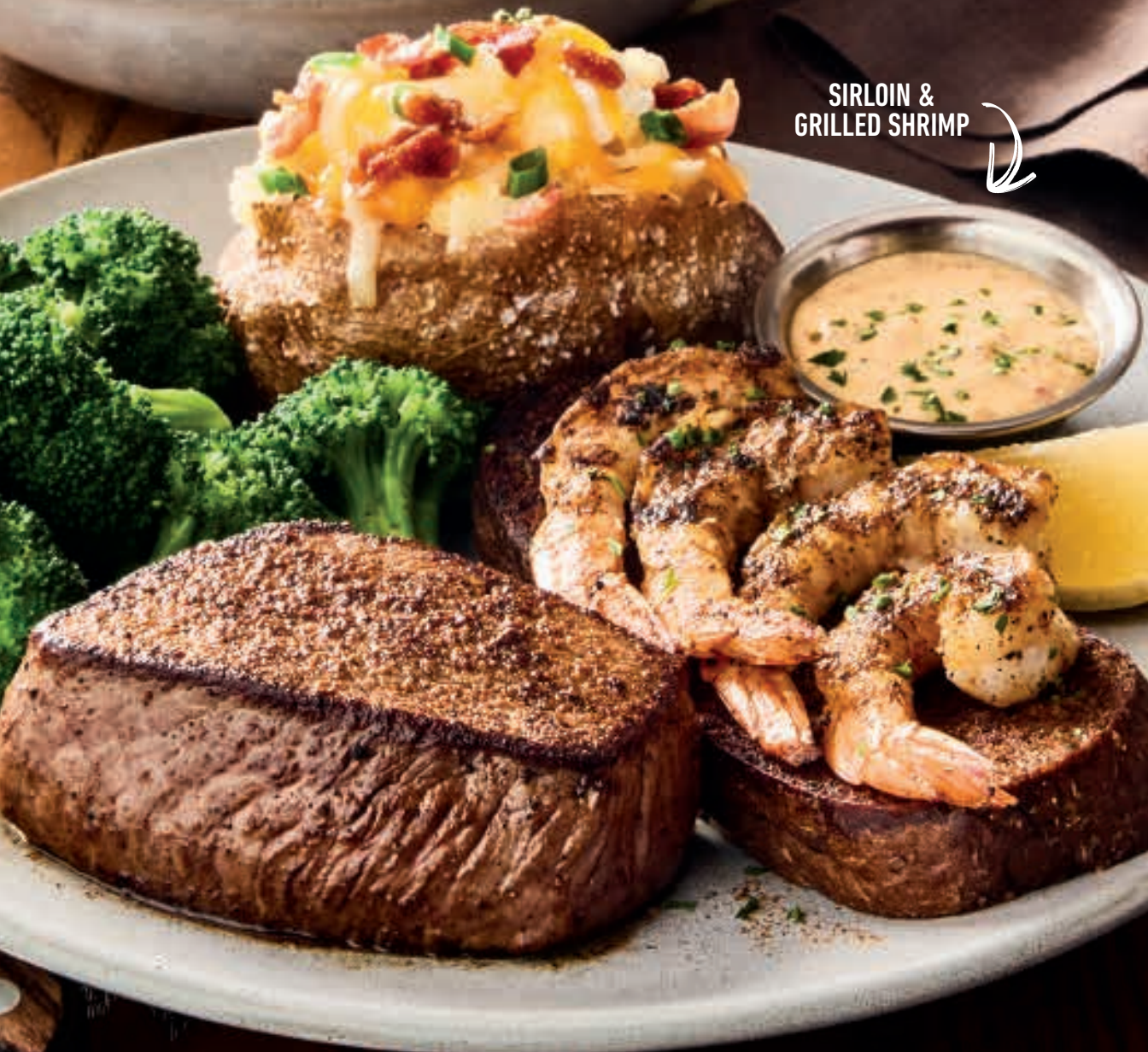
SIRLOIN & GRILLED SHRIMP