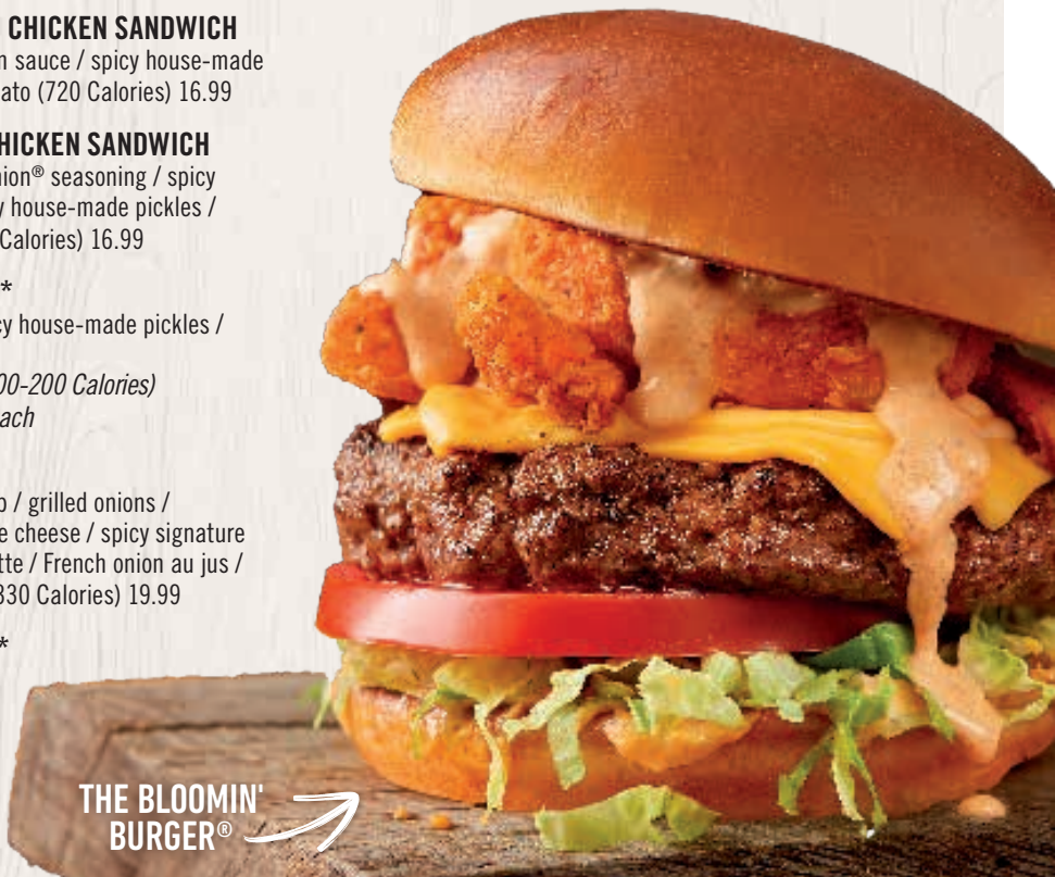
THE BLOOMIN' BURGER ®

THE BLOOMIN' BURGER ®* Bloomin' Onion ® petals / American cheese / spicy house-made pickles / onion / lettuce / tomato / spicy signature bloom sauce (1140 Calories) 16.99