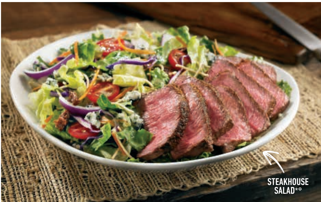
STEAKHOUSE SALAD **

STEAKHOUSE SALAD ** seared Center-Cut Sirloin / mixed greens / Aussie crunch / tomatoes / red onions / cinnamon pecans / Blue Cheese crumbles / green onions / Blue Cheese vinaigrette (1230 Calories) 21.99