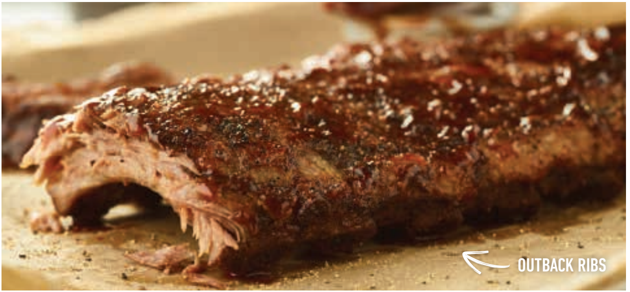
← OUTBACK RIBS