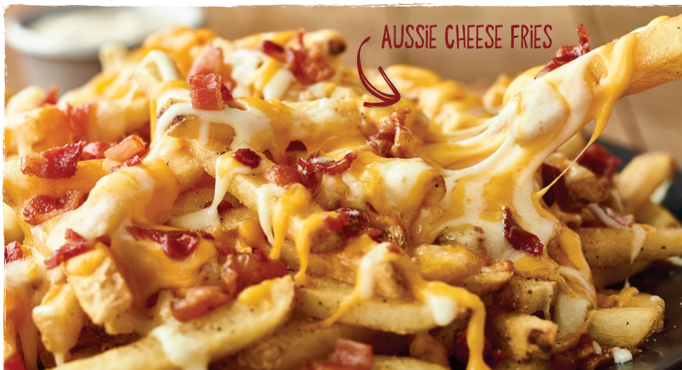
AUSSIE CHEESE FRIES