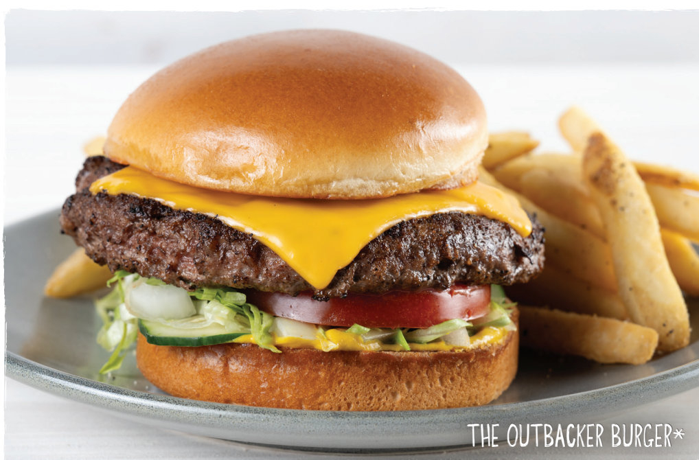
THE OUTBACKER BURGER*

Fresh sliced chicken, crisp romaine, Parmesan cheese and our own Caesar dressing, wrapped in a tortilla. (980 calories) 17.00